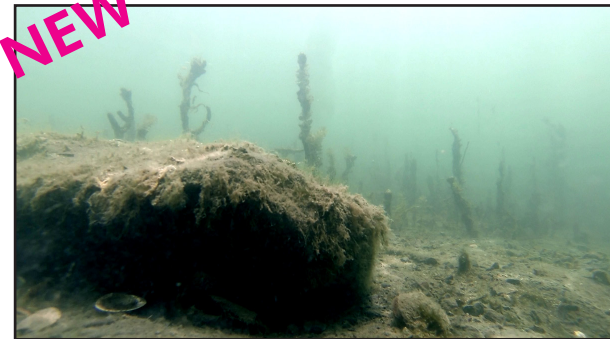
Subsurface Image clipped from video examination of bottom of Capell Cove.

I have provided below a brief description of the survey protocols with sites and dates conducted in the first six months of 2013. This information is for Eurasian Mussel Surveys in the Lake Berryessa Sector of the Solano Project. The funding and assistance for the Lake Berryessa Sector also includes training and certification of Watercraft Inspectors that includes USBR Staff, Lake Berryessa Concessionaires, and SCWA Interns. KD