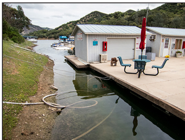
Gas dock, cables, and banks at Markley Marina.

Colonization plates - also called colonization trees - have been placed (hung) from strategic sites at Lake Berryessa marina docks. The colonization trees are typically a mix of materials that are strung on aircraft cable, rope, or chain to extend the selection of materials to 30 - 50 feet depth. All plates are placed with the knowledge and cooperation of the Marina management and the USBR.