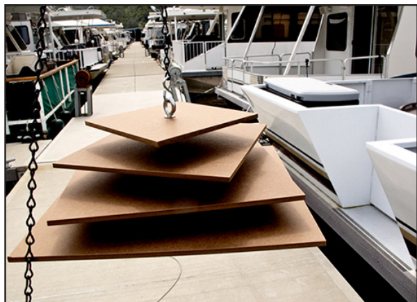
Section of colonization tree that was deployed on the houseboat dock at Markley Cove Marina. The devices are locked to avoid theft and vandalism.